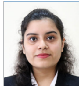
Thakur Rashi Ashok Legal Aid Committee