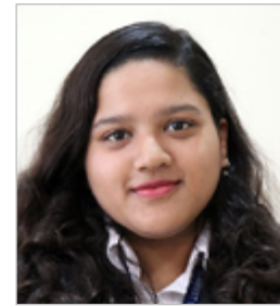
Shreejee Choudhary Environmental Law & Animal Rights Committee