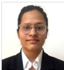
Jaya Moot Court Committee